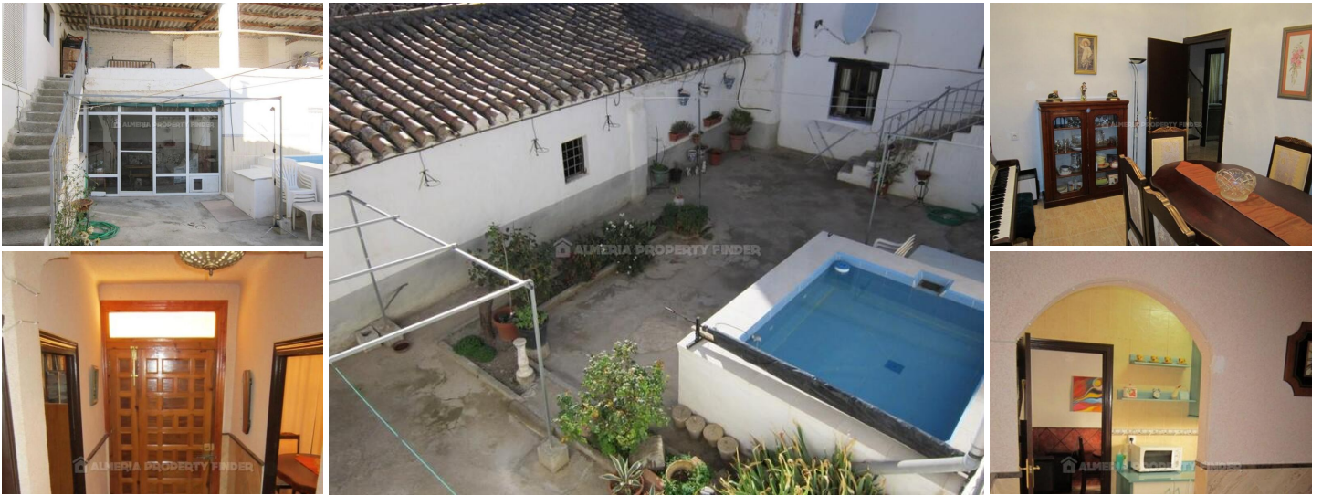
Casa Lepanto - A town house in the Caniles area. (Renovated)