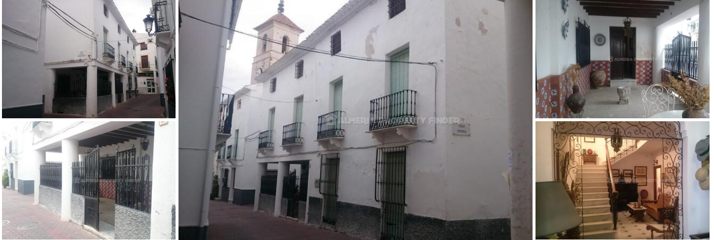
Casa Gigante - A town house in the Albánchez area. (Habitable)

Enormous 9+ bedroom townhouse for sale in Almeria, situated in the picturesque traditional Spanish town of Albánchez, close to the main square. This property would be ideal as a large family home, or for someone who would like to set up a guest house / bed & breakfast. The house has its own secure parking to the rear of the building.