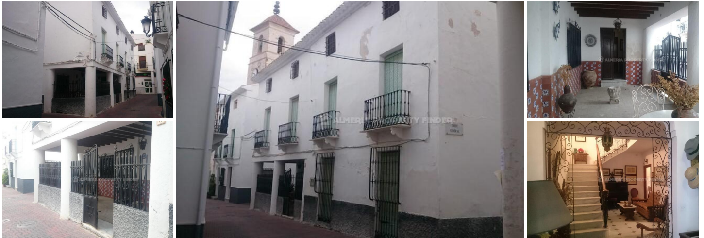
Casa Gigante - A town house in the Albánchez area. (Habitable)

Enormous 9+ bedroom townhouse for sale in Almeria, situated in the picturesque traditional Spanish town of Albánchez, close to the main square. This property would be ideal as a large family home, or for someone who would like to set up a guest house / bed & breakfast. The house has its own secure parking to the rear of the building.