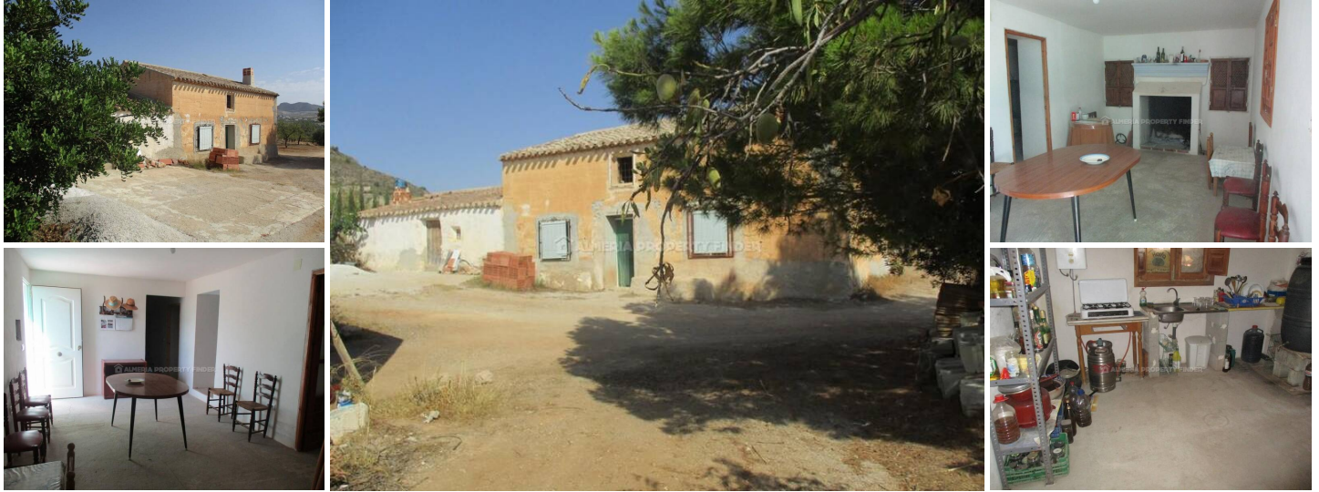
Cortijo Solano - A country house in the Oria area. (Partially Reformed)

Traditional detached 4/5 bedroom country house for sale in Almeria Province, situated 3km from the town of Oria which offers all amenities including bars, restaurants, supermarkets, bakery, butchers, banks, 24 hour medical centre, and pharmacy. There is also an outdoor municipal swimming pool which is open during the summer months, and a small market every Sunday morning. Oria is just under an hour from the coast, and around 1 hour 20 minutes from Almeria airport.