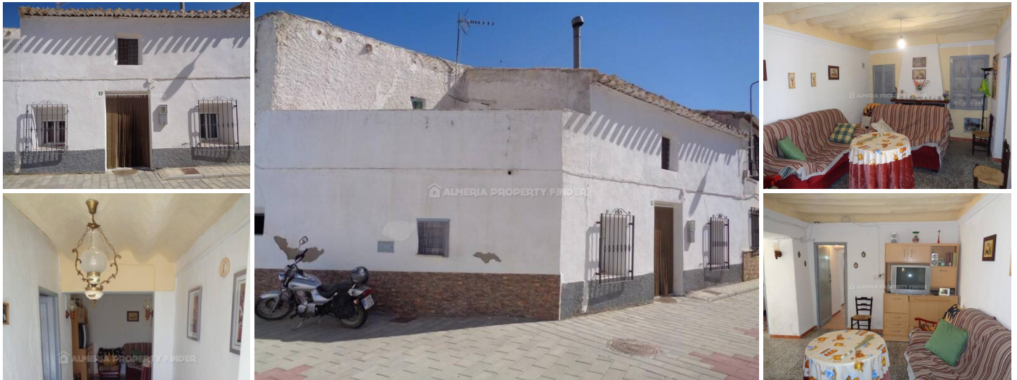
Casa de Amador - A town house in the Partalooa area. (Habitable)

Large habitable 2+ bedroom townhouse for sale in Almeria Province, situated in the charming town of Partalooa. The property is completely habitable but in need of some modernisation / renovation work, and has the potential to become a large family home with up to 6 bedrooms.