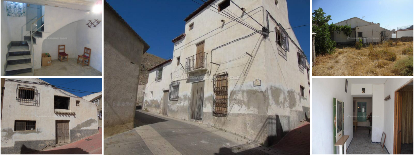
Casa Luciana - A town house in the Oria area. (Partially Reformed)