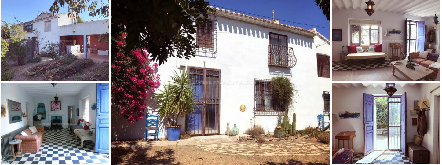
Cortijo los Molinas - A country house in the Albox area. (Renovated)