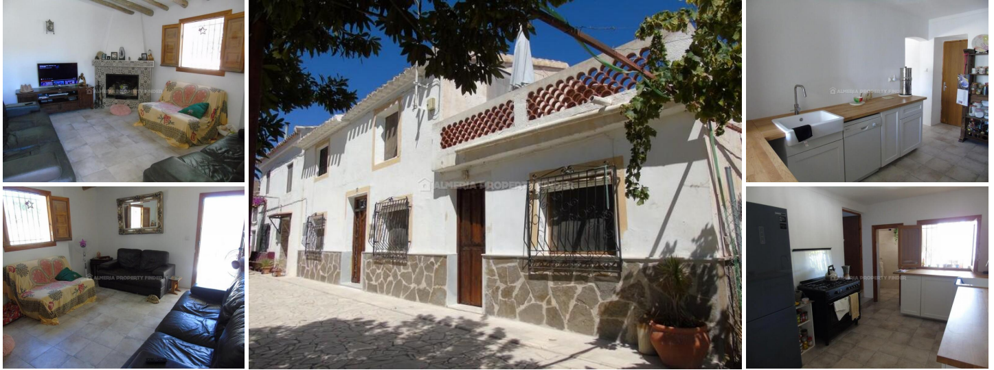
Cortijo La Parra - A village house in the Arboleas area. (Renovated)