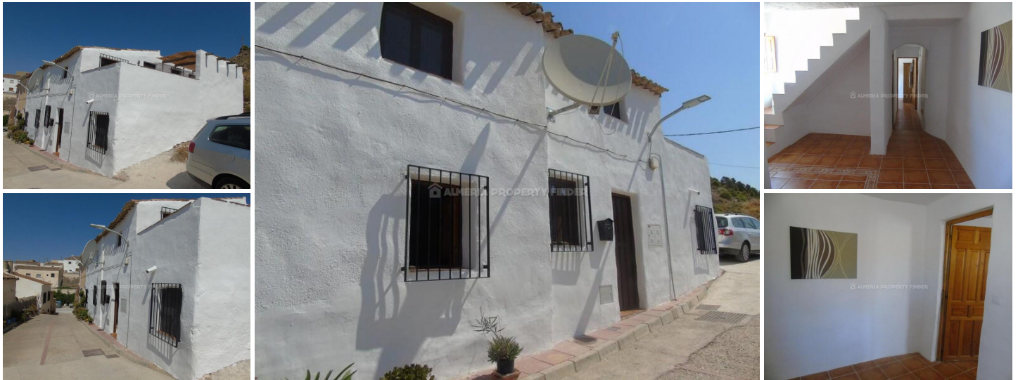
Casa Citronela - A town house in the Somontin area. (Resale)

***EXCLUSIVE TO ALMERIA PROPERTY FINDER***