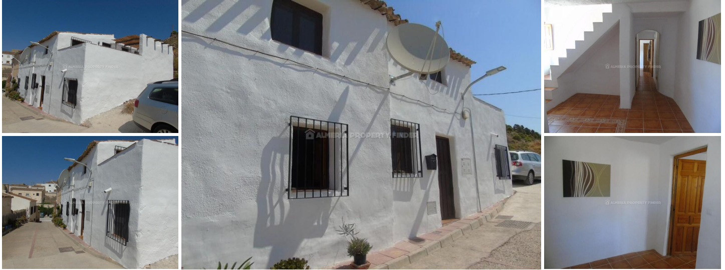
Casa Citronela - A town house in the Somontin area. (Resale)