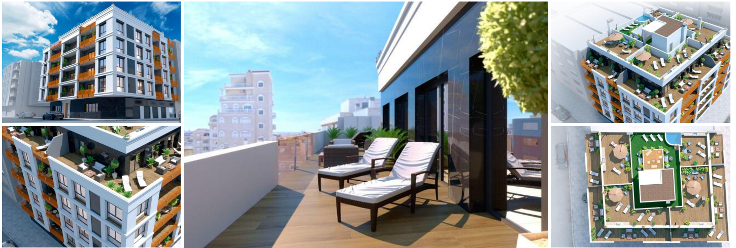
Modern New Build Apartments in Central Torrevieja Costa Blanca