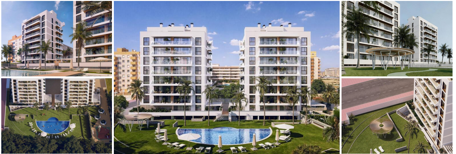
Modern New Build Apartments Near the Beach and Marina in Guardamar del Segura