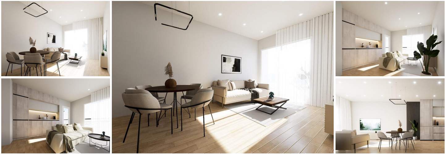
Modern 1 bedroom flat in the centre of Torrevieja

In a quiet and modern urbanisation, this cosy one-bedroom flat is located on the ground floor. With an open-plan layout that integrates the living room, dining room and kitchen into one room, the flat offers a feeling of spaciousness. The bedroom provides an intimate and comfortable retreat, with enough space for a double bed and functional storage. The carefully designed bathroom is equipped with modern finishes.