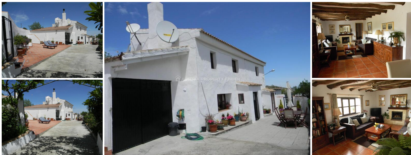
Cortijo Delauna - A country house in the Caniles area. (Renovated)

A beautifully renovated 3 bedroom, 2 bathroom country cortijo with fantastic views, having a build of 208m 2 , is fully gated and located in a small hamlet on the edge of the Sierra de Baza National Park, accessed via a tarmac road.