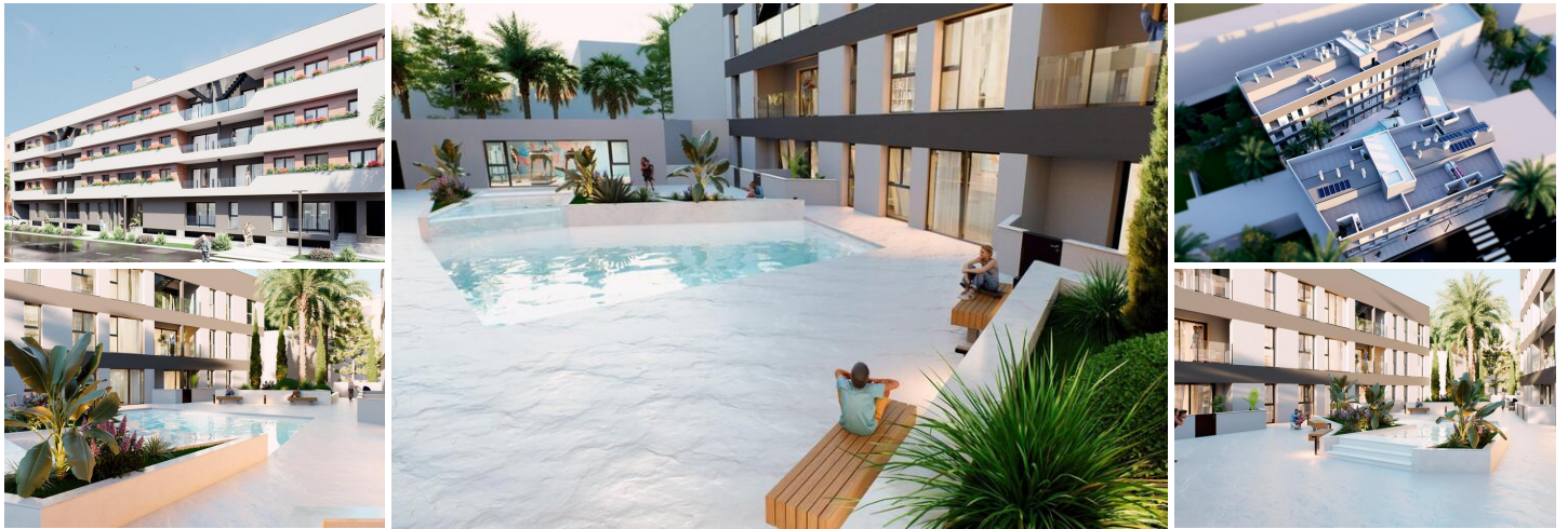
New Build Apartments for Sale in Lo Pagan (San Pedro del Pinatar) Near the Beach