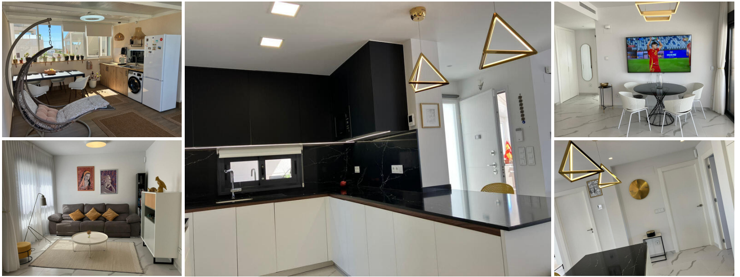
Luxury Ground Floor 2-Bedroom Apartment – Mirador de San Miguel, San Miguel de Salinas

Modern ground-floor apartment located in the exclusive Mirador de San Miguel residential area, built in 2021. The property offers 92 m 2 of built space on a 135 m 2 plot, providing bright, comfortable living areas and well-designed outdoor spaces.