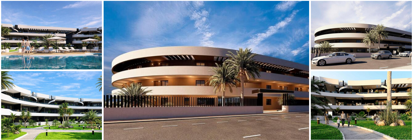
Luxury Golf Front Apartments Near the Sea in Los Alcazares Costa Calida