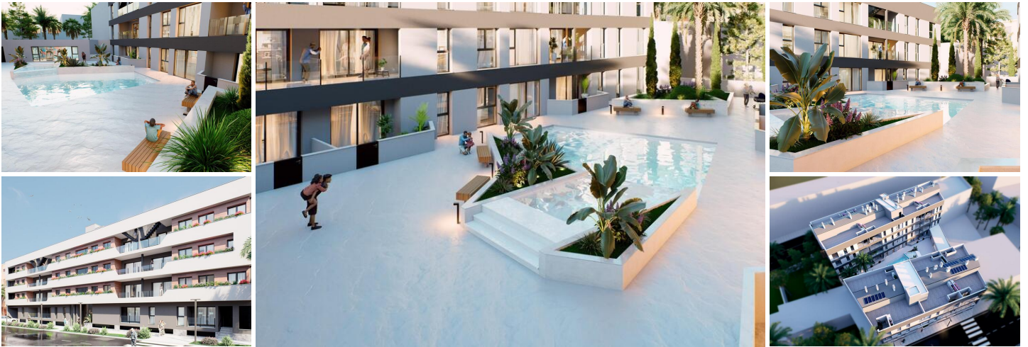
New Build Apartments for Sale in Lo Pagan (San Pedro del Pinatar) Near the Beach