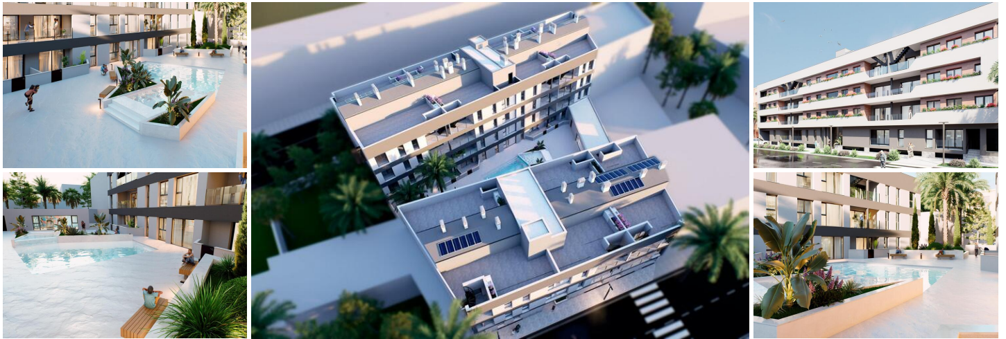
New Build Apartments for Sale in Lo Pagan (San Pedro del Pinatar) Near the Beach