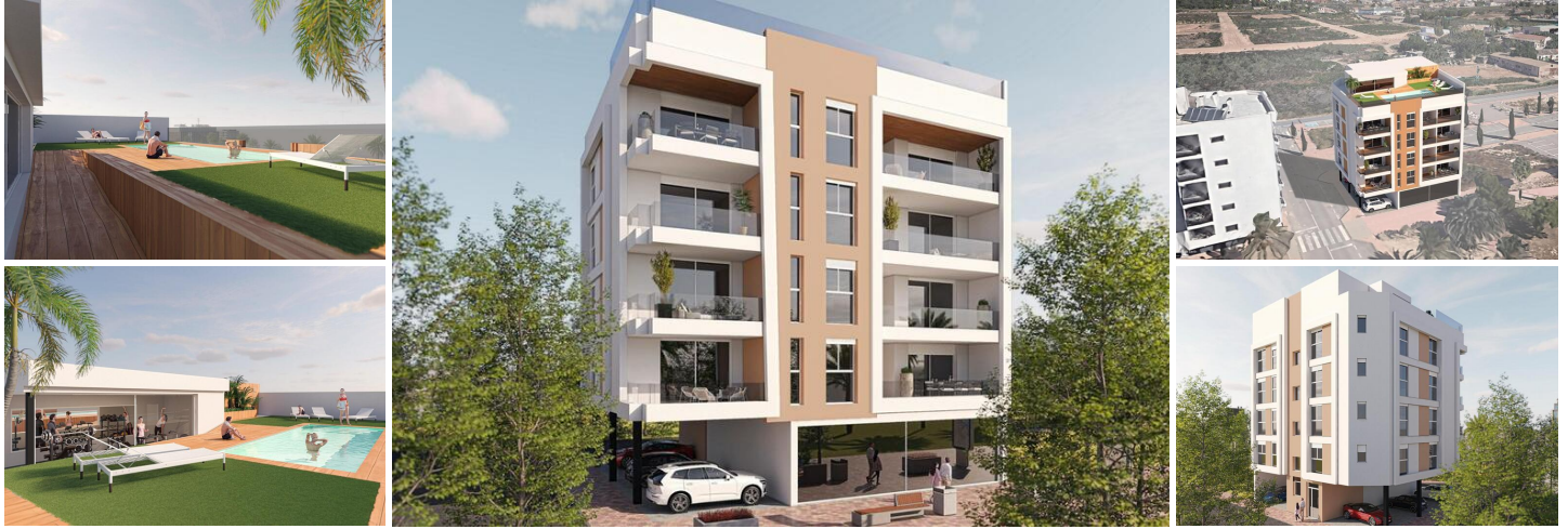
Tourist Licensed New Build Apartments Near the Beach in Lo Pagan San Pedro del Pinatar