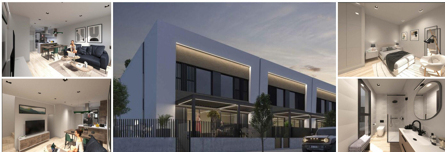
Modern Townhouses in Dolores with comunal pool