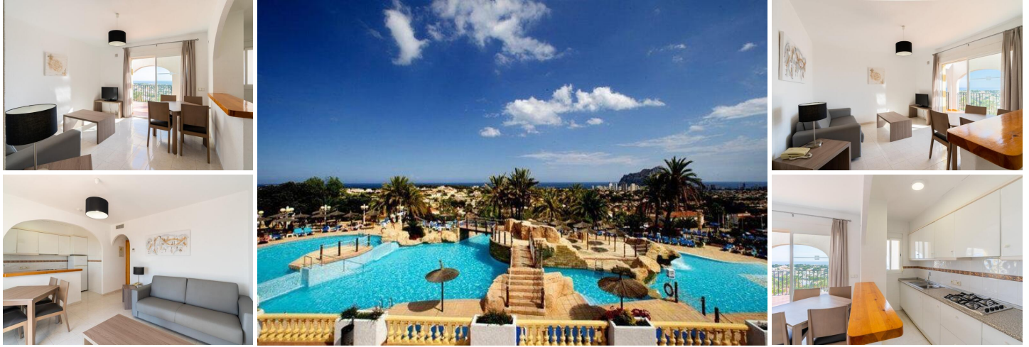
UPPER FLOOR BUNGALOW APARTMENTS IN CALPE

Beautiful bungalows on the top floor with 1 bedroom, 1 bathroom, American kitchen with living room, built-in wardrobe and terrace.