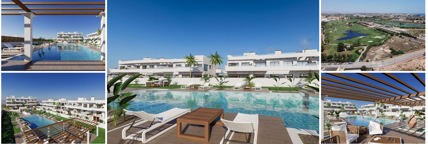
New Build Residential Complex Near Serena Golf and the Mar Menor in Los Alcazares