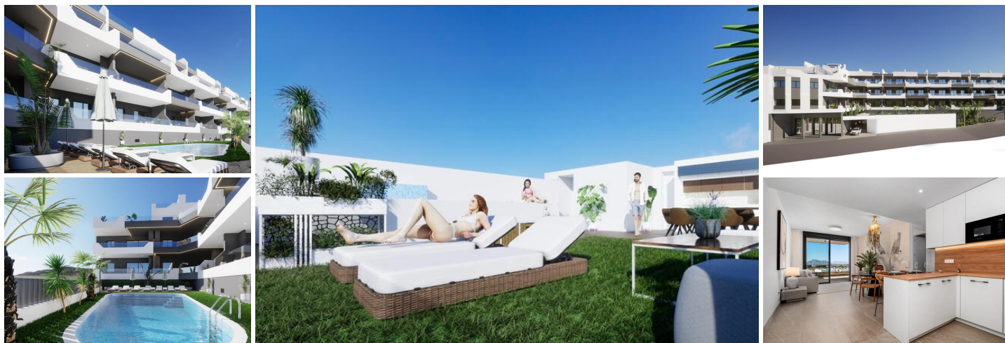
NEW BUILD BUILD RESIDENTIAL COMPLEX IN BENIJOFAR

New Build residential complex in the quiet area of Benijofar.