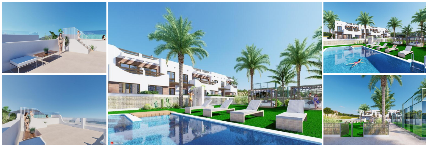
Modern Living Steps from Las Higuercas Beach in Torre de la Horadada