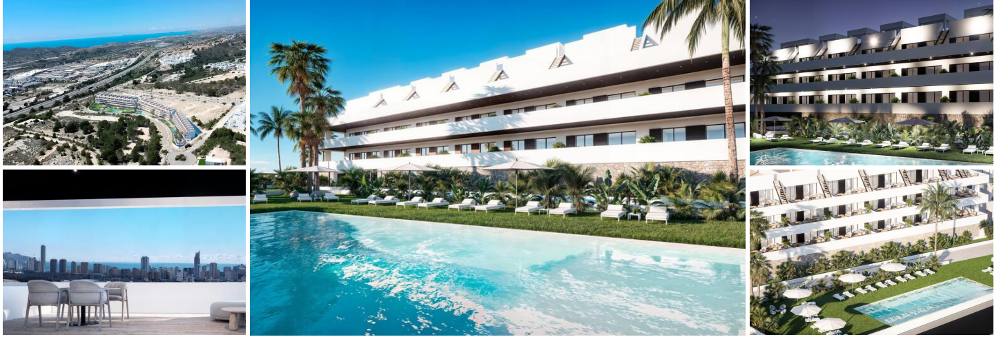
Exclusive New Build Residences with Sea Views in Finestrat, Alicante

Prime Location with Panoramic Views of Benidorm and the Mediterranean