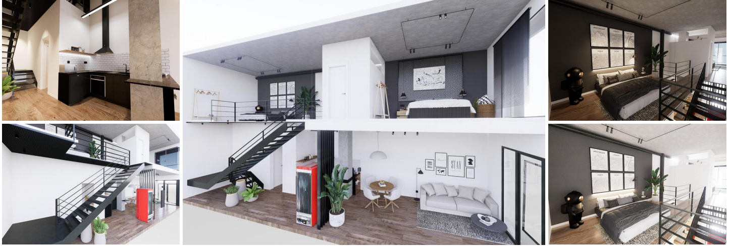
Modern Duplex Loft Apartments in the Heart of Alicante