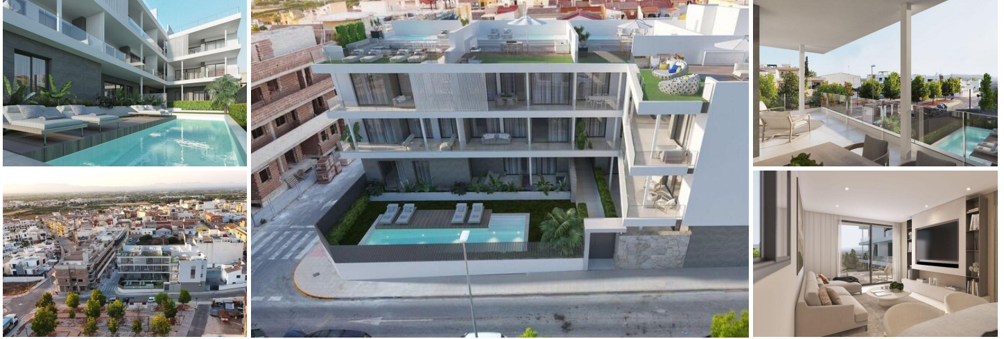
New Build Apartments in Benijofar with a central location