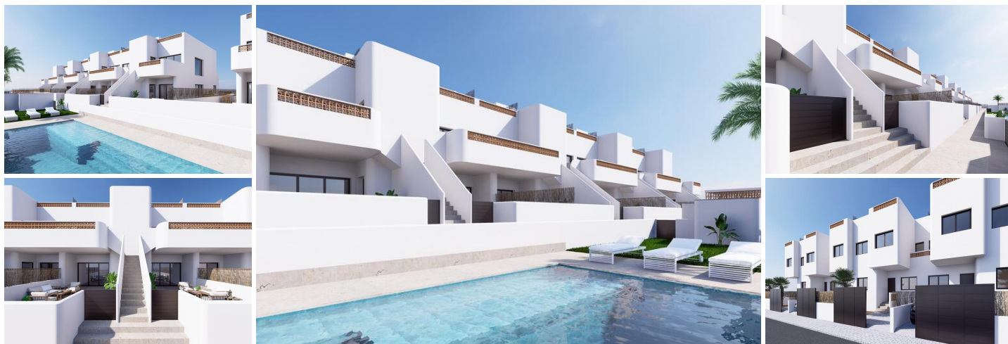
New construction bungalows in Dolores

Residential with ground floor properties with garden or top floor with private solarium, with 3 bedrooms and 2 bathrooms, are located in Dolores (Alicante), a privileged area of the Costa Blanca, located next to the Natural Park El Hondo, surrounded by nature and equipped with all the services.