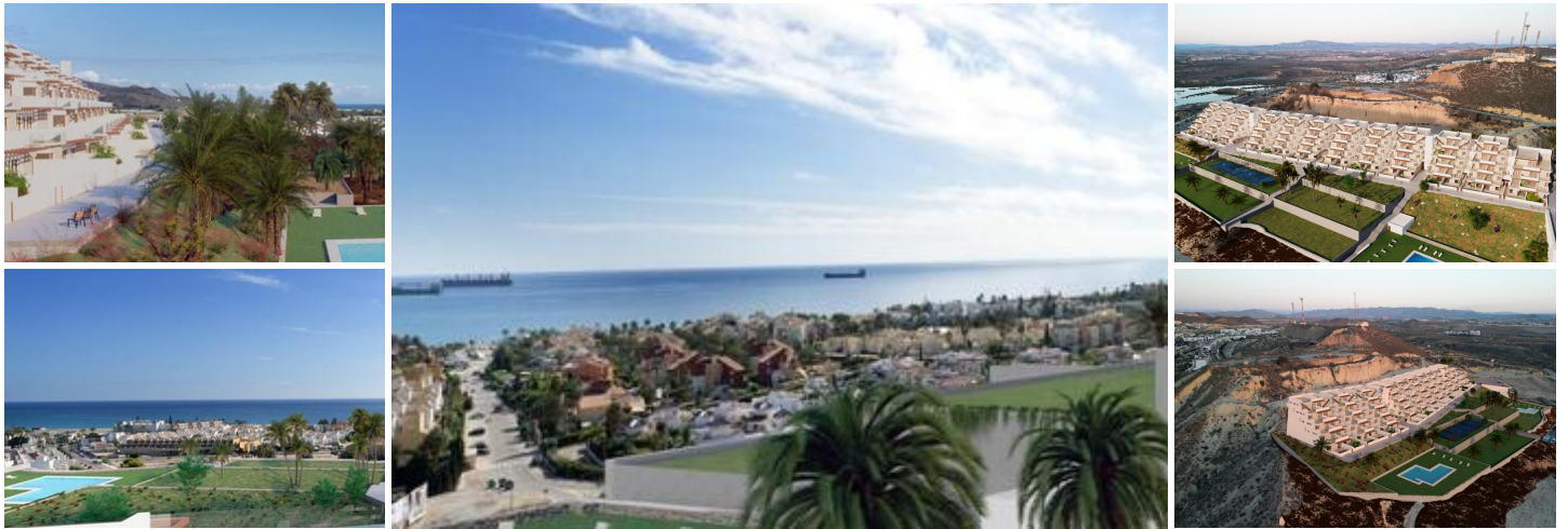
New Build Apartments with Sea Views in Vera Playa, Almería

Discover this exceptional new residential development in Vera Playa, offering 27 modern apartments in its first phase. Designed to combine comfort, functionality, and spectacular Mediterranean views, this project is ideal for those seeking a home on the Costa de Almería with style and convenience.