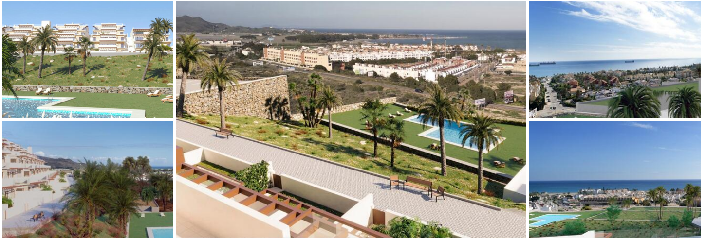
New Build Apartments with Sea Views in Vera Playa, Almería

Discover this exceptional new residential development in Vera Playa, offering 27 modern apartments in its first phase. Designed to combine comfort, functionality, and spectacular Mediterranean views, this project is ideal for those seeking a home on the Costa de Almería with style and convenience.