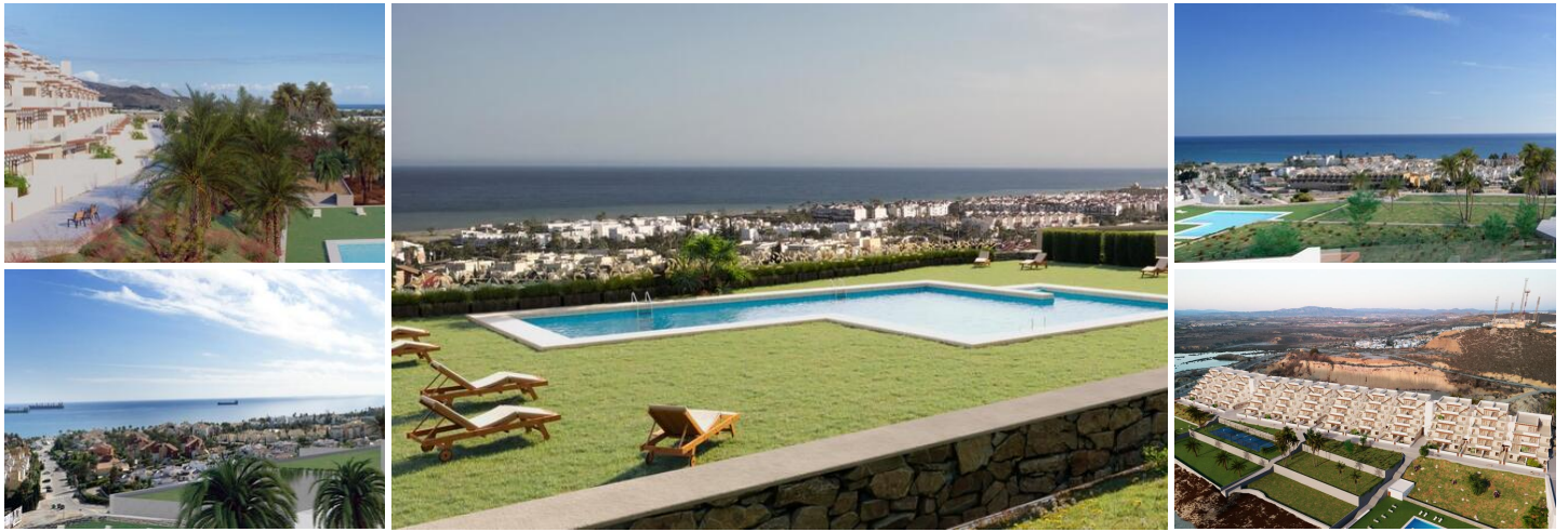
New Build Apartments with Sea Views in Vera Playa, Almería

Discover this exceptional new residential development in Vera Playa, offering 27 modern apartments in its first phase. Designed to combine comfort, functionality, and spectacular Mediterranean views, this project is ideal for those seeking a home on the Costa de Almería with style and convenience.