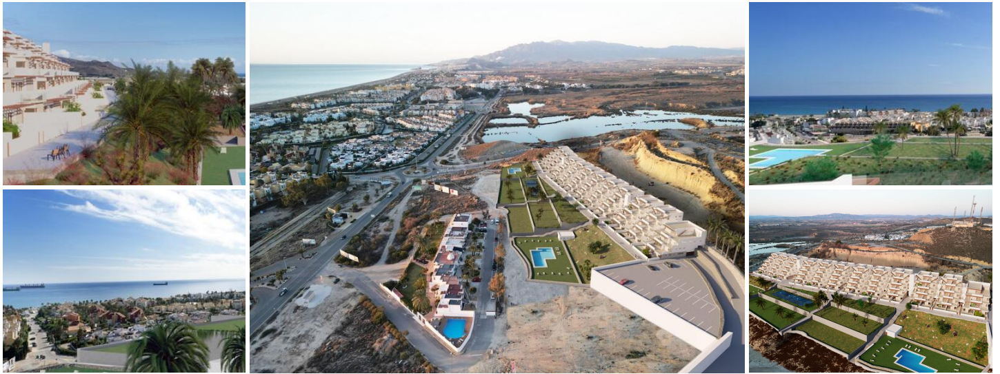
New Build Apartments with Sea Views in Vera Playa, Almería

Discover this exceptional new residential development in Vera Playa, offering 27 modern apartments in its first phase. Designed to combine comfort, functionality, and spectacular Mediterranean views, this project is ideal for those seeking a home on the Costa de Almería with style and convenience.