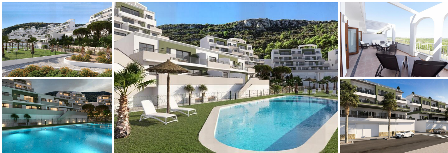
New Build Apartments with Sea Views in Xeresa Costa Blanca North