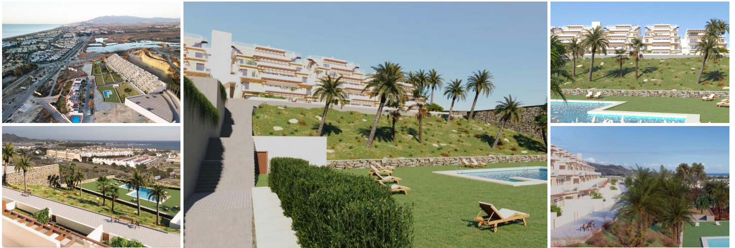
New Build Apartments with Sea Views in Vera Playa, Almería

Discover this exceptional new residential development in Vera Playa, offering 27 modern apartments in its first phase. Designed to combine comfort, functionality, and spectacular Mediterranean views, this project is ideal for those seeking a home on the Costa de Almería with style and convenience.