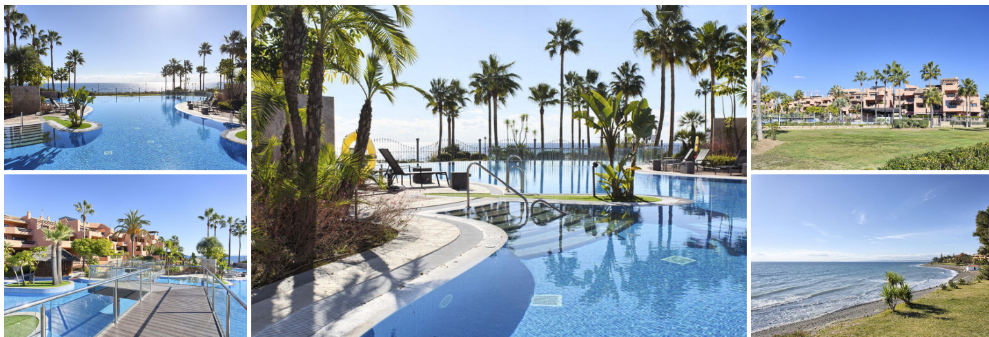
2-Bedroom Apartment in Exclusive Beachfront Urbanization – Mar Azul, New Golden Mile, Estepona

Set within the prestigious beachfront community of Mar Azul on Estepona's highly desirable New Golden Mile, this elegant 2-bedroom, 2-bathroom apartment offers a refined coastal lifestyle with direct beach access and outstanding on-site facilities. The vibrant Estepona town centre, with its restaurants, bars, and shops, is within easy walking distance.