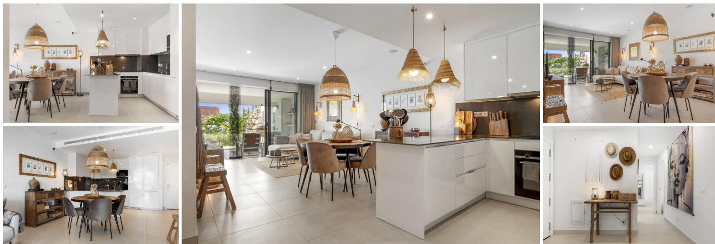
Modern 2-Bed Garden Apartment in Mirador del Golf, Estepona

Contemporary ground-floor 2-bedroom apartment in the sought-after Mirador del Golf development next to Estepona Golf. Built in 2021, this southwest-facing home enjoys all-day sun and open views to gardens, mountains, and a glimpse of the sea.