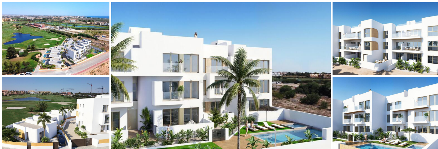
New Build Residential Complex in Los Alcázares on the Frontline of Serena Golf