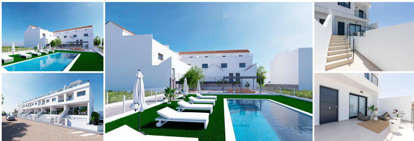
Modern Townhouses with Solarium and Basement in Rafal, Alicante