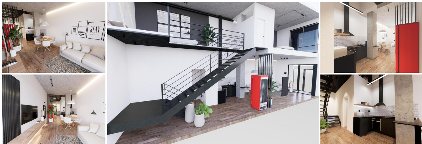
Modern Duplex Loft Apartments in the Heart of Alicante