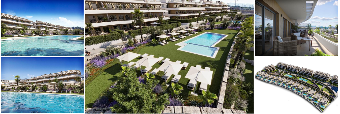
Luxury New Build Apartments and Villas with Panoramic Sea Views in Finestrat