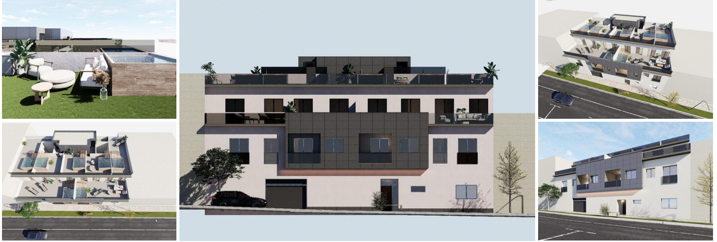
New Build Apartments in Pilar de la Horadada with private Jacuzzi