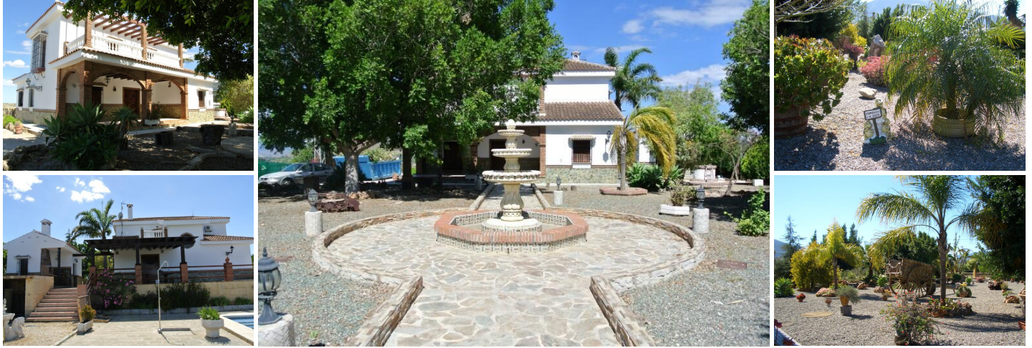
Spacious Two-Storey Finca on a 12,000m 2 Olive Plot – Alhaurín el Grande

Discover this expansive, unfurnished finca located on the outskirts of Alhaurín el Grande, easily accessed via a flat track and set within peaceful countryside surroundings. Offering generous living space across two floors, the property enjoys complete privacy, beautiful landscaped gardens, and breathtaking panoramic views.