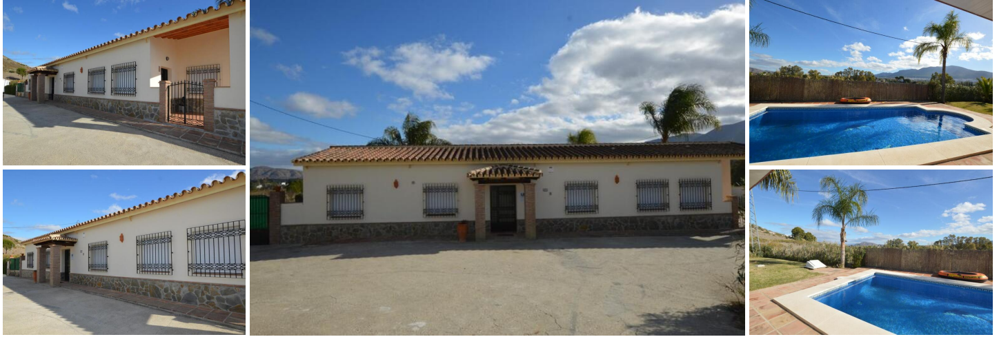
Two Charming Semi-Detached Villas – Alhaurín el Grande / Coín Border

Two delightful single-storey semi-detached homes set side by side, each offering 2 bedrooms, 1 bathroom, a comfortable lounge/diner and a fully fitted kitchen.