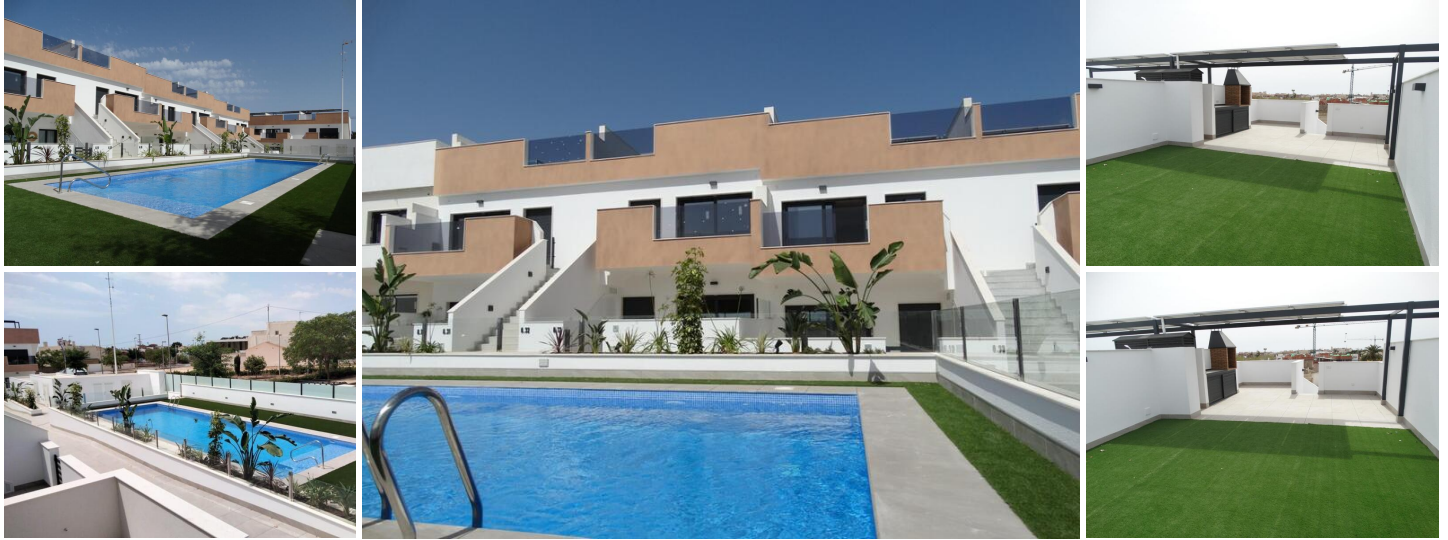
Newly Built Bungalows with Solarium or Garden in Pilar de la Horadada