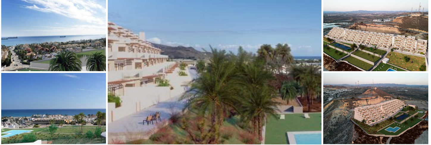
New Build Apartments with Sea Views in Vera Playa, Almería

Discover this exceptional new residential development in Vera Playa, offering 27 modern apartments in its first phase. Designed to combine comfort, functionality, and spectacular Mediterranean views, this project is ideal for those seeking a home on the Costa de Almería with style and convenience.