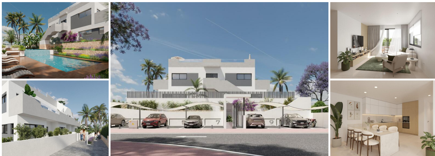
New Build Residential Complex in Los Balcones, Torrevieja