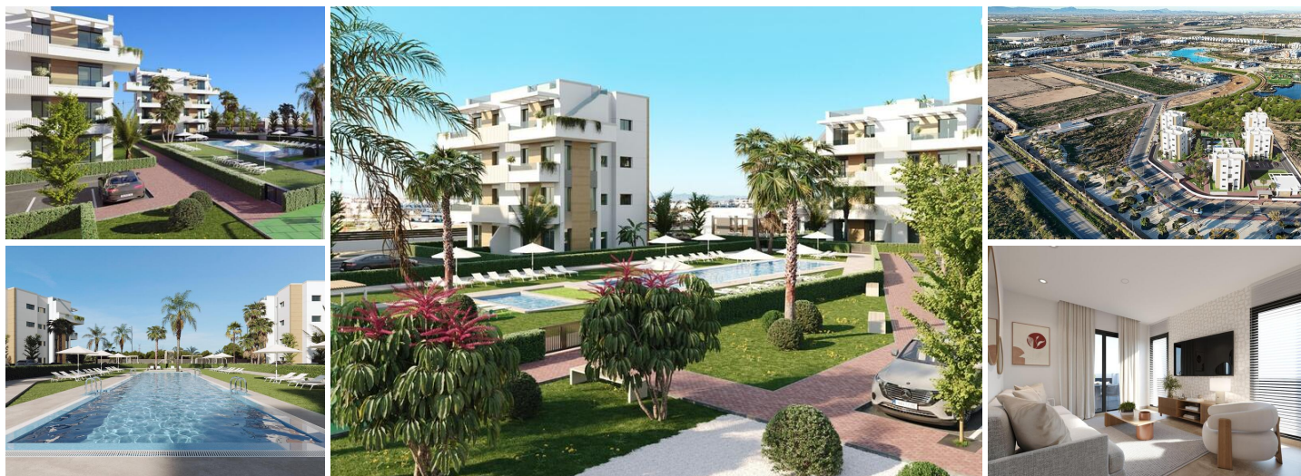
New Build Tourist Apartments in Santa Rosalía Lake and Life Resort Costa Cálida