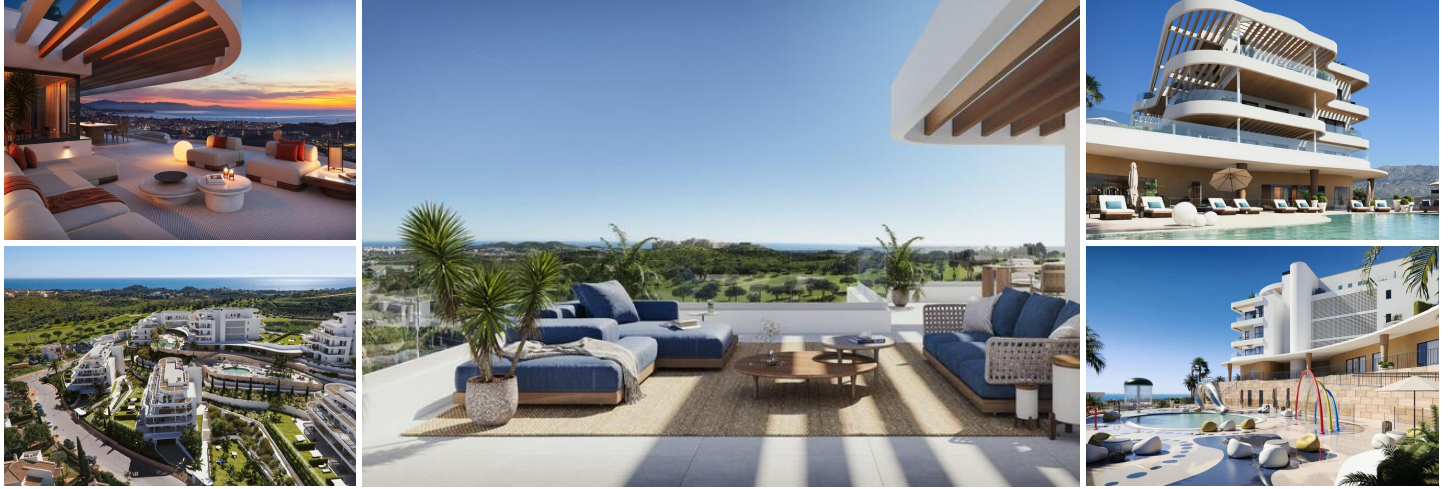
Luxury New Build Apartments in Cerrado del Águila Golf, Mijas with Sea and Golf Views

Experience an exclusive lifestyle in this modern new build resort located in the prestigious Cerrado del Águila Golf area of Mijas. Surrounded by nature and boasting panoramic 360° views of the Mediterranean Sea, mountain view and the golf course, this development offers the perfect combination of elegance, comfort, and convenience on the Costa del Sol.