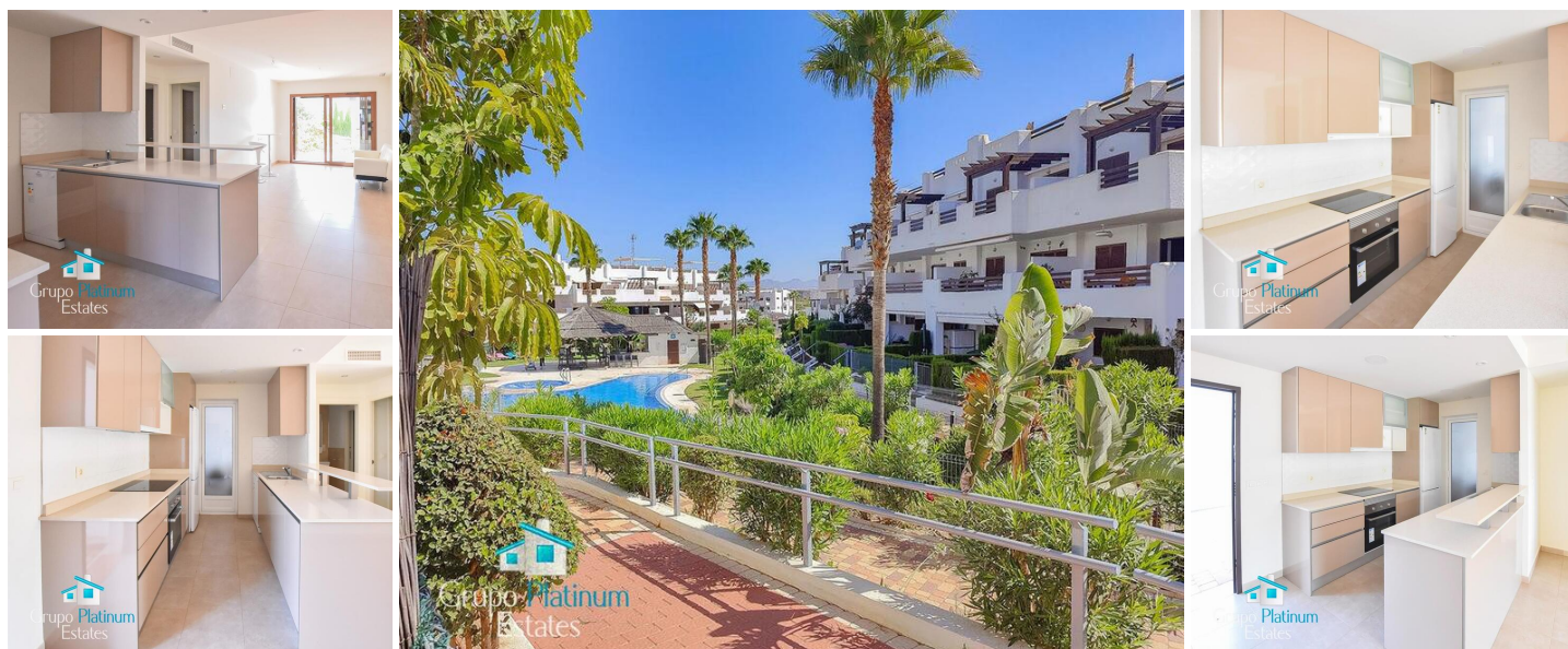
Ground Floor Apartment in Phase 4 of Mar de Pulpí!

Grupo Platinum Estates presents this ground floor apartment located just a short walk from the beach in the Mar de Pulpí residential complex, Phase 4 Las Azucenas . Call now to arrange a viewing at +34 950 46 61 12!