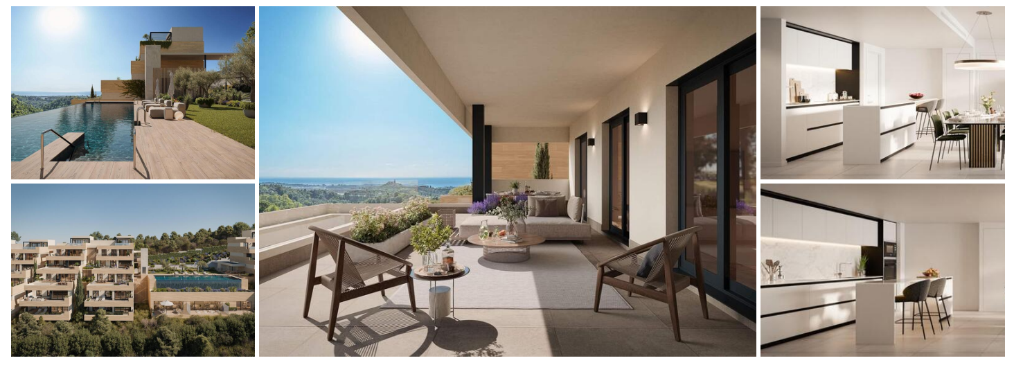
Exclusive new-build residential development in Marbella

New homes in Marbella! Elegance, relaxation and tranquillity in a privileged setting