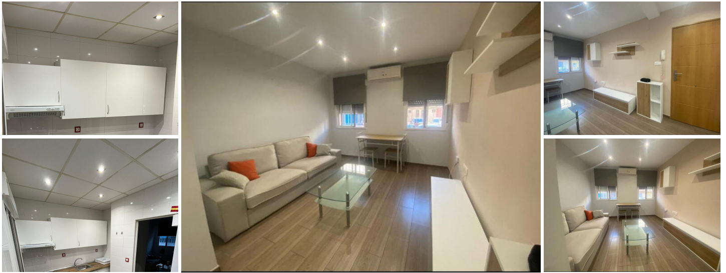
Fully Renovated 2-Bedroom Ground Floor Apartment in San Ginés, Cartagena

Located in the desirable San Ginés area of Cartagena, this beautifully renovated two-bedroom apartment offers modern comfort and stylish living. The property features a separate brand-new kitchen equipped with a hob, oven, and extractor fan — perfect for home cooking.